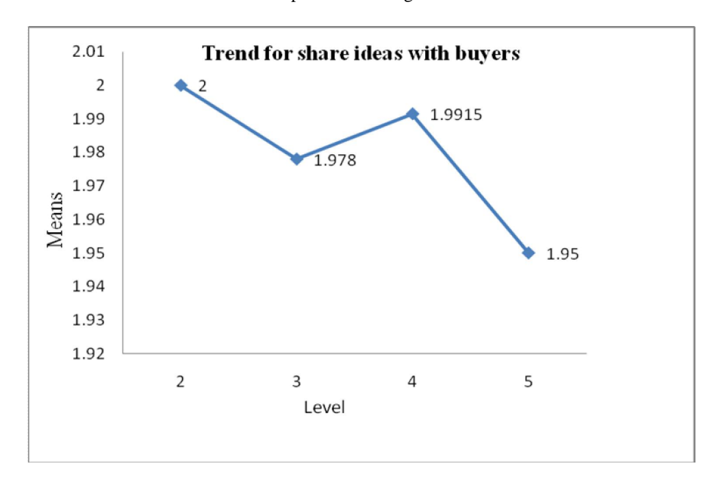
Graph 1.1: Trend for Share Ideas with Buyers for KT

The Table 1.2 shows the value of F = 1.723 which is smaller than the critical value of 2.63 for the F-distribution at 3 and 261 degrees of freedom and 95% of confidence. The significant value of p>0.05 with value of F indicates that the null hypothesis is accepted and thus alternative hypothesis H_{1b} is rejected. This concludes that knowledge transfer is not directly affected with the sharing of knowledge from buyers and suppliers. The trend in means as shown in Graphs 1.1 and 1.2 also confirmed that there is weak form of relationship with knowledge transfer.